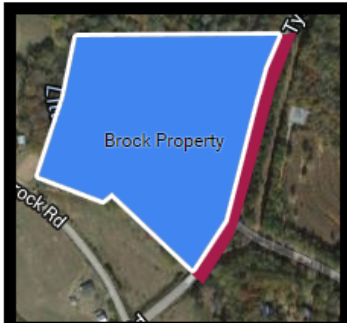
2715 Tyus-Carrollton Rd.