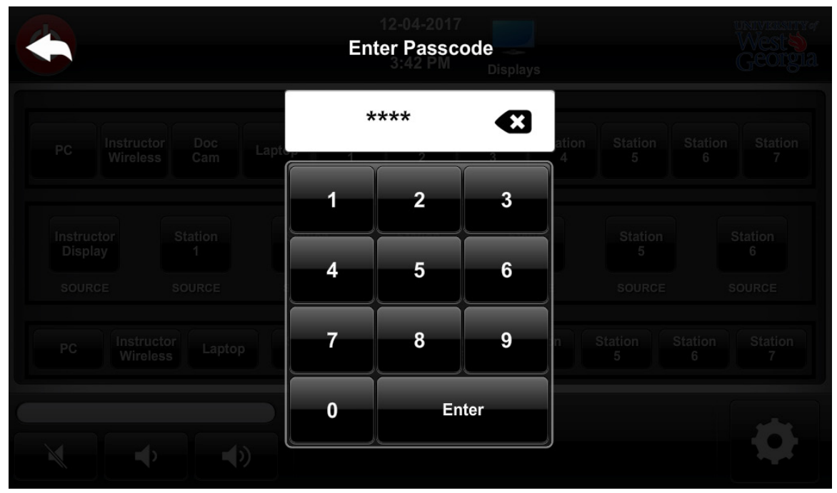
Passcode Entry Subpage

To access the display power controls, tap the tech button and enter the four-digit pin.